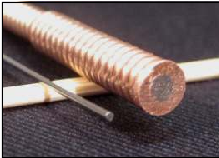
Cross sections of wires used for the highest and lowest note on the piano (balanced on a toothpick).

The sustaining power of the lowest notes of the piano is remarkable when compared to the very brief vibration made by the highest notes with their much lighter strings.