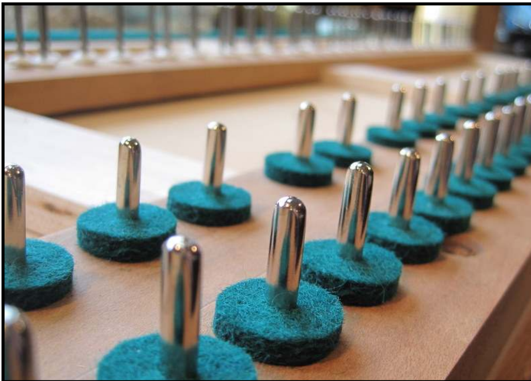
New set of keybed felts in place.

"In business to bring your piano to its full potential."