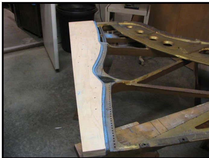
Underside of cast iron plate with new pinblock installed.

In order to access the pinblock not only do the tuning pins and strings need to be removed, but the cast iron plate must be carefully lifted from the piano. Only when the plate is out of the instrument may the pinblock be removed for duplication.